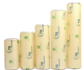
300mm | 350mm | 400mm | 450mm | 500mm

Size can be customized according to your specification