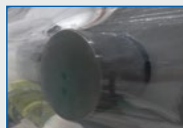
Containment Force on 6" disc